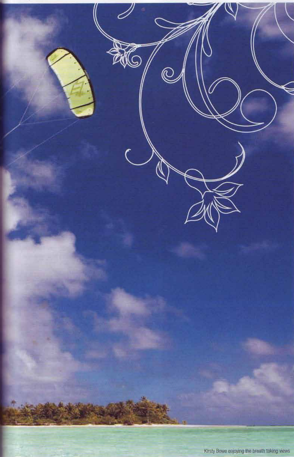
Kirsty Bowe enjoying the breath taking views

The tropical, turquoise waters and breathtaking surrounding islands of Aitutaki were this year the venue for the third annual Cindy Mosey Island Odyssey. 12 girls (well 13 if you count token female lan our photographer) from all over world, had come together to share their same passion and enthusiasm for kiteboarding