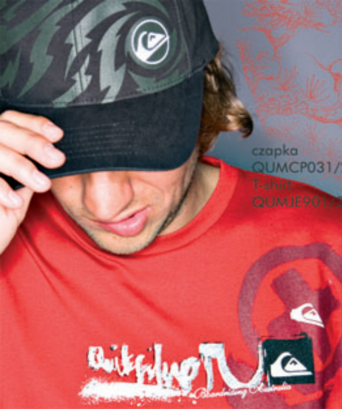
czapka QUMCP031/200 T-shirt QUMJE901/33/396