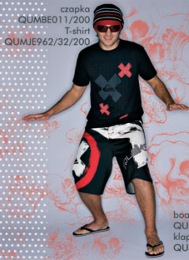
czapka QUMBE011/200 T-shirt QUMJE962/32/200