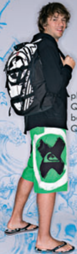
plecak QUMBA011/200 boardshorty QUMBS393/598