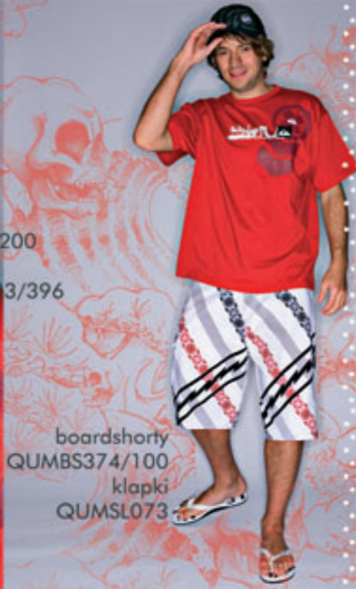
boardshorty QUMBS374/100 klapki QUMSL073